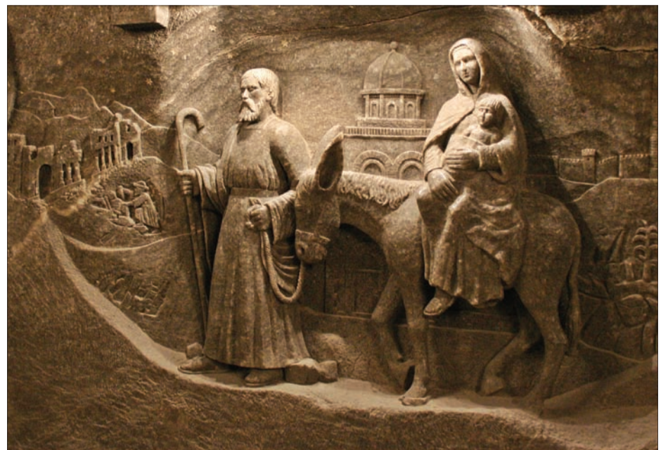
The walls of the Chapel of St. Kinga are covered with religious panoramas.

The black letters pressed into a plate of gold ahead of me reads Kopalnia Soli (salt mine). The chill in the air condenses my breath. From somewhere close by, I hear the clanging of machinery and automated instructions spoken in English, German and Polish.