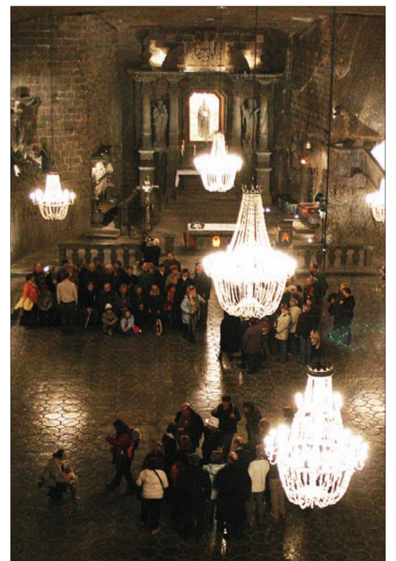
The Chapel of St. Kinga is the grand finale of the Wieliczka salt mine tour.

St. Anthony's Chapel changes all that. Carved by the miners into the leaden rock salt, this fairy-tale world of life-size statues glistens under the quiet, soft light. Like all good fairy tales, there's