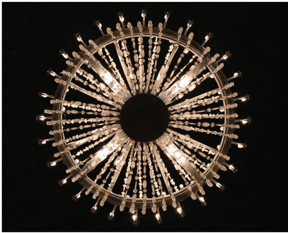
Salt-crystal chandeliers hang in the Chapel of St. Kinga.

a princess involved. According to legend, when Princess Kinga of Hungary became betrothed to King Boleslaw the Bashful of Poland around 700 years ago, she threw her engagement ring into Hungary's salt mines. This, somehow, was supposed to guide her to the salt supplies in her adopted country, Poland. When drilling started in Wieliczka, miners found not only salt but the engagement ring itself.